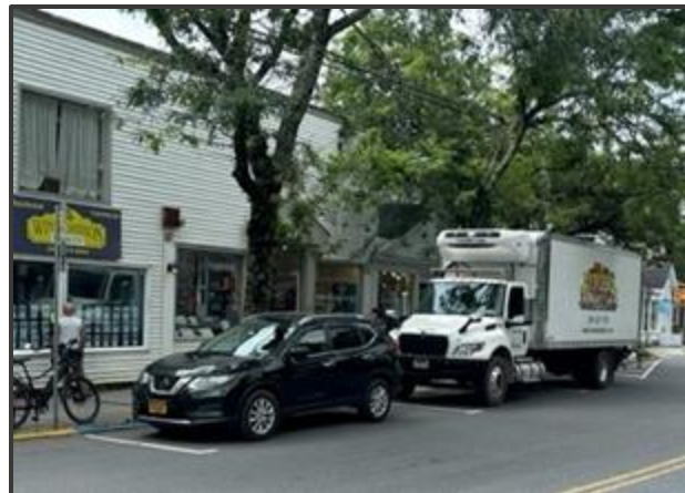
Rt 212 Village Green (disabled spots)