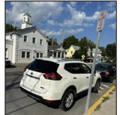
Rt 212 @ Comeau Drive