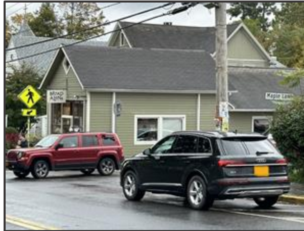
Rt 212 @ Maple Lane (West Corner)

Vehicles often parked in spots reserved for disabled drivers.