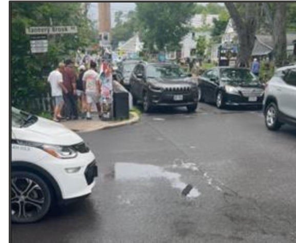
Rt 212 @ Tannery Brook Rd