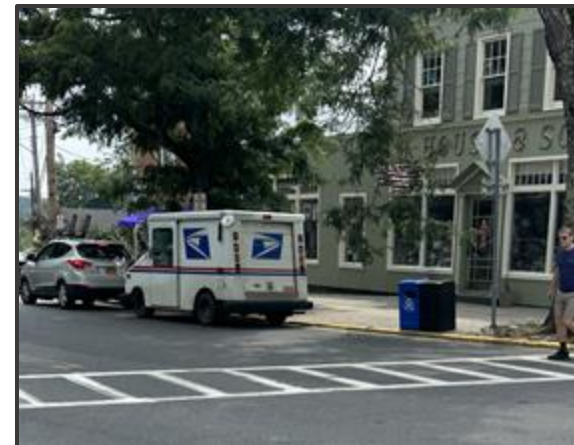
Rt 212 Village Green