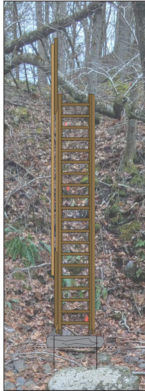
TIMBER STEPS WITH PHOTO REFERENCE